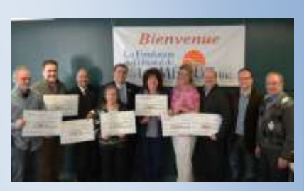
Launching of the campaign